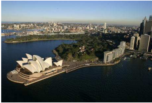
Sydney Opera House

Circular Quay - Situated at a small inlet, Circular Quay is a starting point for most attractions based around the harbour. It is a vibrant and bustling place with ferries every few minutes to different parts of the harbour. The Sydney Opera House is located here.