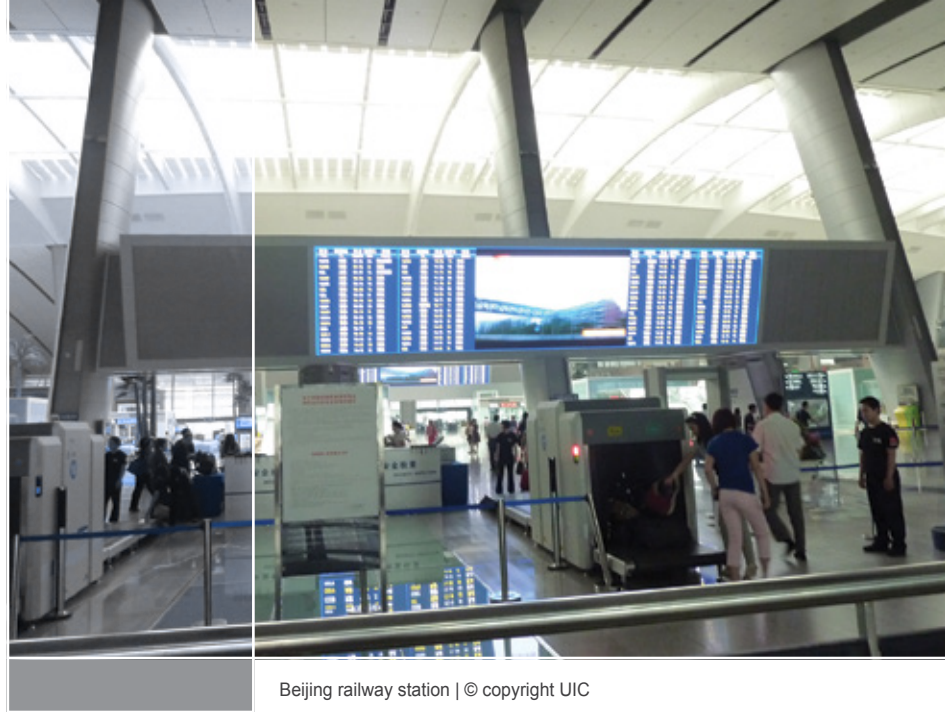
Beijing railway station