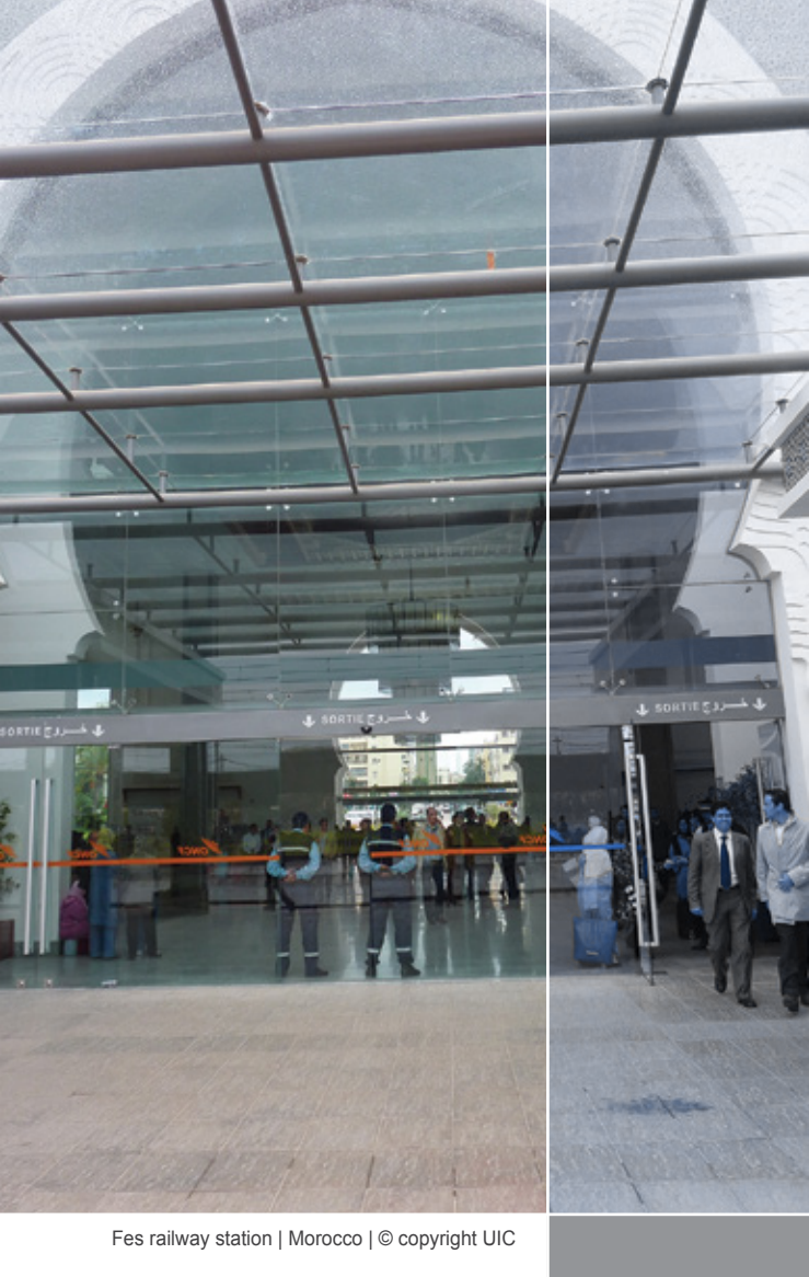
Fes railway station | Morocco | © copyright UIC

This leaflet results from the activity of the “human factors” working group within the framework of the UIC security platform.