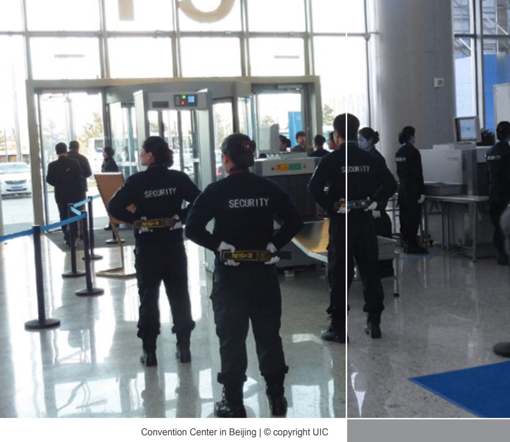
Convention Center in Beijing