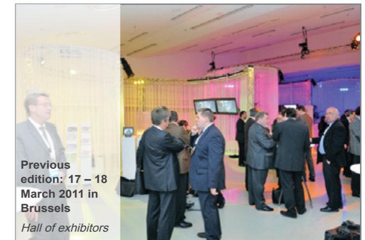
Previous edition: 17 – 18 March 2011 in Brussels