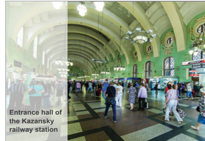
Entrance hall of the Kazansky railway station

In the 1950s Kazansky Station became the first intermodal hub in Moscow as it was connected to Komsomolskaya underground station. At present, the transport hub also includes Leningradsky and Yaroslavsky stations situated on the opposite side of Komsomolskaya square. The current building and the part in which Next Station 2013 will be held is considered to be an architectural monument and is protected by the Moscow Heritage Committee.