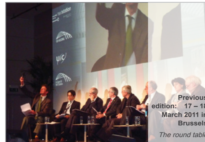
Previous edition: 17 – 18 March 2011 in Brussels