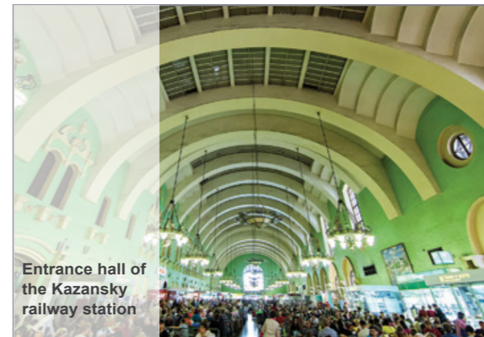
Entrance hall of the Kazansky railway station