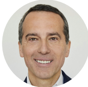
Christian Kern Former Federal Chancellor Republic of Austria