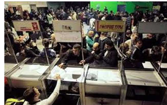
Irritated passengers who missed their connecting flight...

For an airline, good flight planning means the difference between making money or losing money on flights.