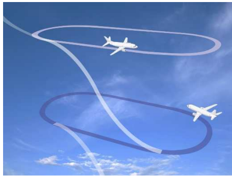
In holding pattern to wait for landing slot: costly waste of time.