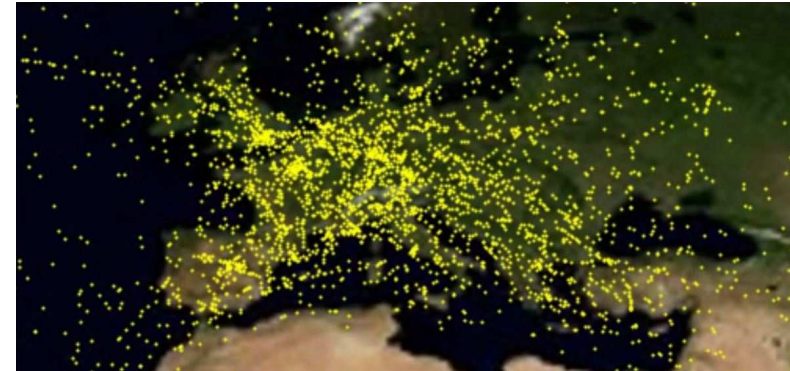
Busy day over Europe...congested airspace.

Most (fuel) efficient route depends heavily on direction and speed of wind on cruising altitude. Great Circle is shortest, but heavy tailwind will compensate the longer distance of Jetstream Route.