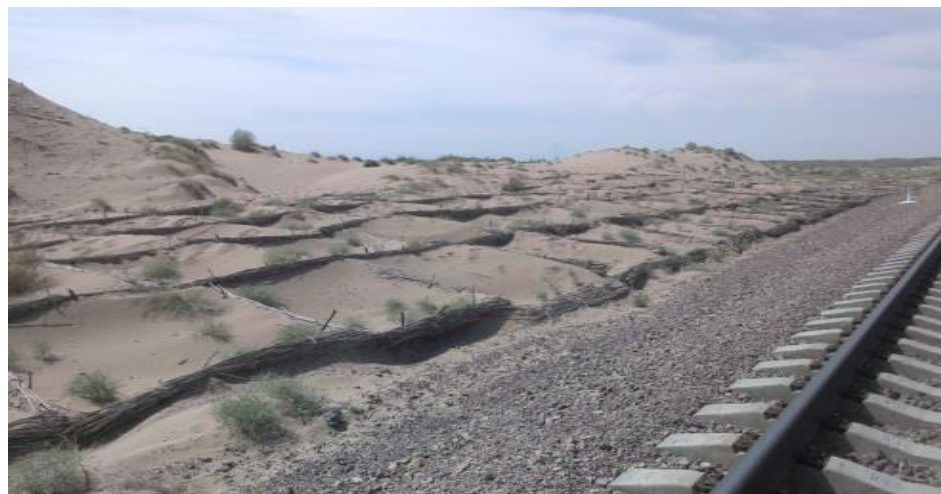
Fences for sand protection