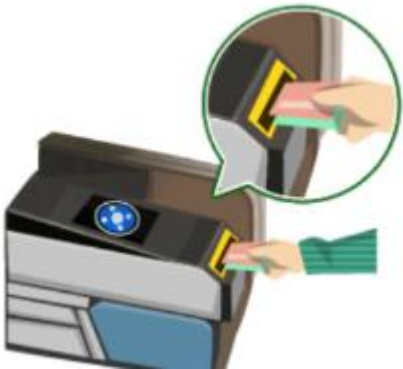
Scene of inserting paper ticket to Ticket validation gate