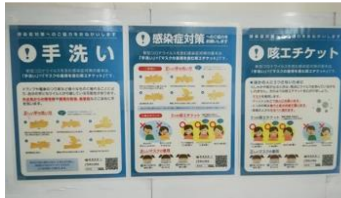
For Using information bulletin board at the station