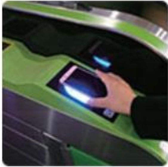
Scene of activating E- ticket to Ticket validation gate