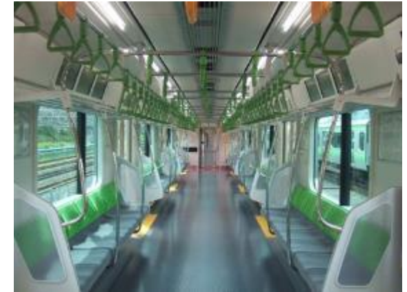
Train uninstalled automatic ventilation system