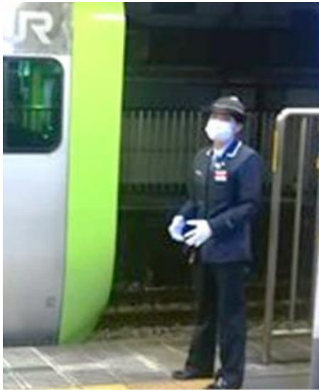
Wearing face mask