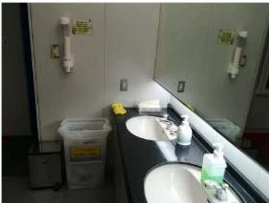
Sanitizing tool at station public toilets