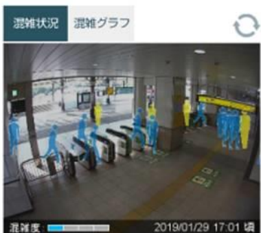
Expressing crowded level by smartphone application