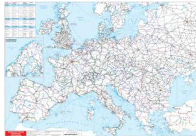
Rail Freight Corridors (RFC) map 2015 Including extensions foreseen in 2016 as indicated by the RFCs